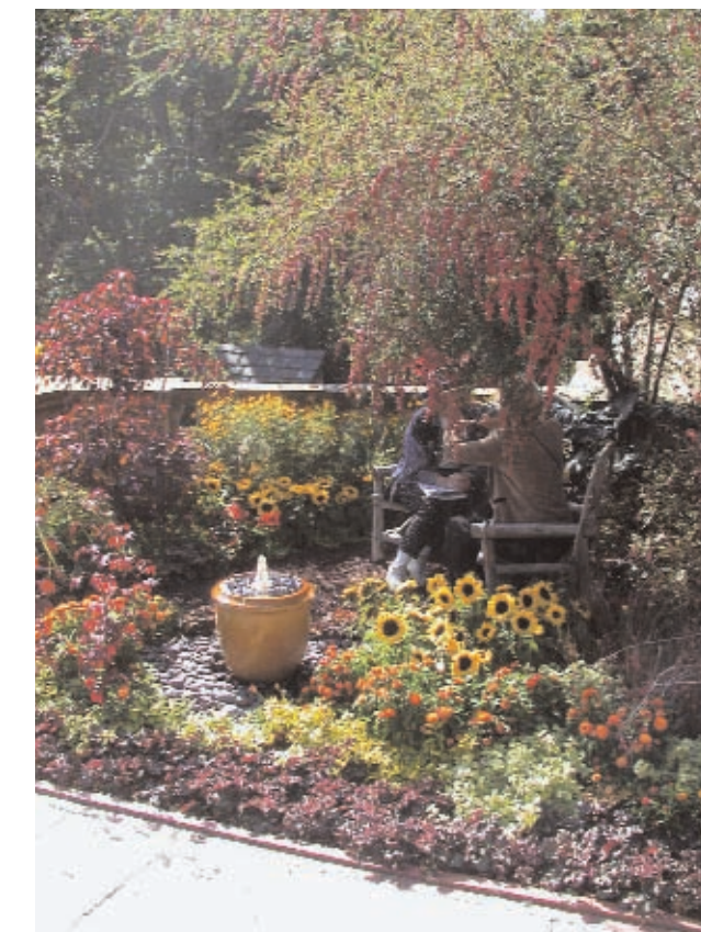
Greystone Park is located at 905 Loma Vista Drive, Beverly Hills, CA 90210. For more information, visit greystonemansion.org .

Clockwise: Elegant flowers are just as beautiful as sculptures or fountains. Used as a centerpiece, the base serves as a platform for an organic work of art. • Don't invest in expensive fixtures for your garden. Rustic skeletal furniture is an easy thrift find that will work for your budget, and fit in with the style of an English countryside. • A raised view of the Greystone garden shows the structure and layout of the landscape. • A cozy sitting area in the garden allows you to relax and appreciate wildlife and nature. Even as simple as two antique chairs, having a shady nook is essential. • This rectangular pond is perfect for the symmetrically shaped garden. Complimenting the home, the landscape is beautiful, clean and well structured.